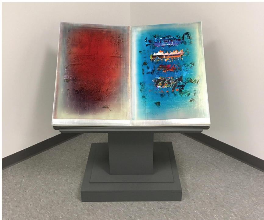
ACTIVE PORTAL, 2015 acrylic on canvas, painted wood stand 30" x 40" x 42"

Teichert uses the analogy of being transported when talking about reading and experiencing what we see. In the large-scale painting, Moment by Moment and in the book installation work, Active Portal , the artist aims to provide a point of entry for the viewer to access another space. Your body may remain in place, but the painting allows your mind to transport you somewhere else. In the left panel of Active Portal , we can see how she builds up layers of rich, pigmented glazes that play with light and translucency. This helps to create depth and space where the possibility of an opening or portal to explore and interpret is revealed. Similarly, the dense silver and circular gestures on the left side of Moment by Moment invite your gaze to slow down and move through the layers. The right side of both works are also built up, but glyph-like inscriptions sit on the surface, evoking a 'page' or text to read and decipher.