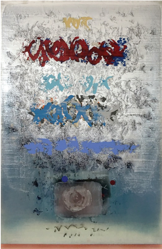
SILVER LINING, 2018, acrylic and crayon on canvas, 55" x 35"