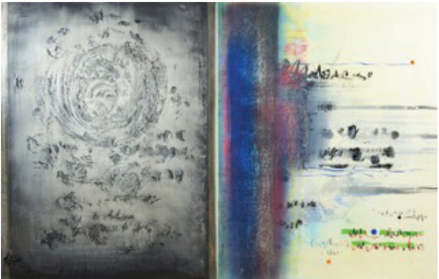
MOMENT BY MOMENT, 2016 acrylic and crayon on canvas, 55" x 82"

These two and three-dimensional paintings and the 16-part print work all in some way explore how image and text are inextricably linked. In fact, don't be surprised if you find yourself 'reading' the artwork! The double page structure, like that of an illuminated manuscript figures prominently in Teichert's artmaking and speaks to the open book form where image and text co-exist to share information. Teichert composes her own visual poetry inspired by music, language and colour that seeks to provide a point of entry to transport and transform the viewer.