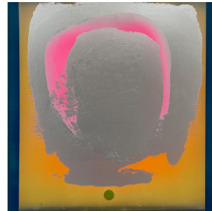
Into the Sun Trio , 2021. Acrylic on Canvas, 24" x 72"