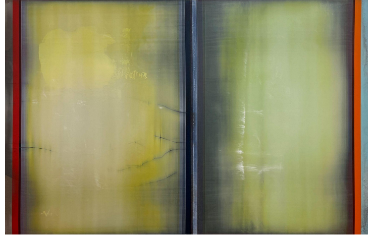
Celestial Considerations , 2022. Acrylic on canvas, 55" x 84"

Fullspread and Celestial Considerations present expansive energy fields of subtle emanating colour. The dot-turned-orb has launched, or possibly not yet entered the scene – notions of progress and teleology are not preoccupations for Teichert – and the central spine in each of these painting gives us a glimpse into before and after, and possibly, if we turn the page, what will come or what came. Cerebral meditations on the rewards of sitting with time, these two large-scale paintings acknowledge history, resist order, and draw their viewer into the infinite now.