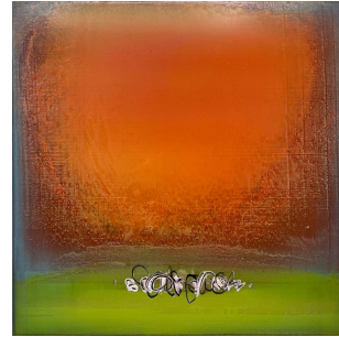
Long Space Time Trio , 2021. Acrylic on Canvas, 24" x 72"