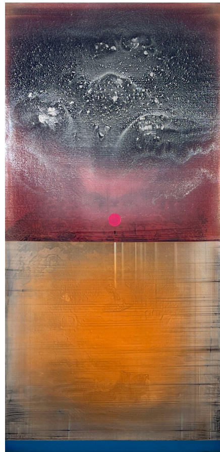
Magnetic Seed , 2021. Acrylic on canvas, 48" x 24"