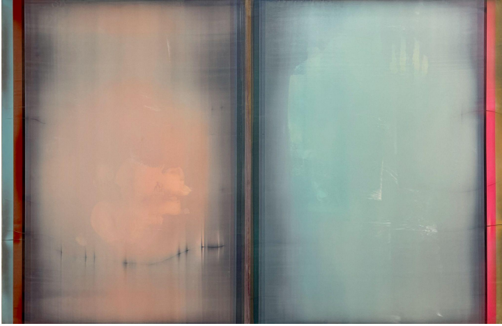
Fullspread , 2022. Acrylic on canvas, 55" x 84"